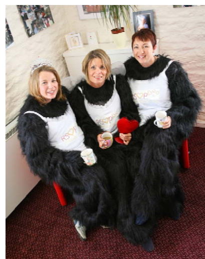
The girls in their gorilla costumes (during & after training)