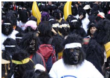
Great Gorilla Runners

Top banana to the girls at RSVP Introductions who are up to some monkey business raising money for endangered mountain gorillas.